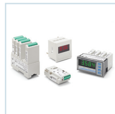
Digital Panel Meters