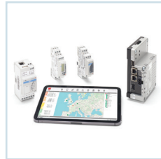
IIoT Data Management, Communication and Control