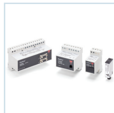
Fieldbus - Dupline