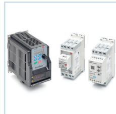
Soft Starters and Frequency Drives