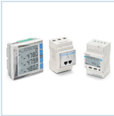
Energy Meters and Analysers