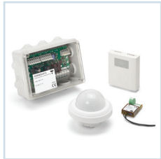
IIoT Field Devices