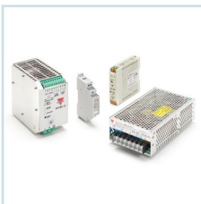
Power Supplies and UPS