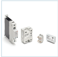
Solid State Relays