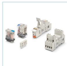
Industrial Relays and Sockets